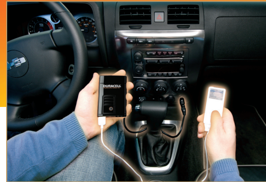
Portable power in your vehicle