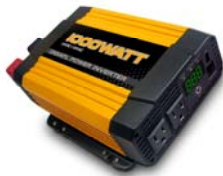
1000W (Model #: 10-00480)