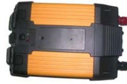
750W (Model #: 10-00479)