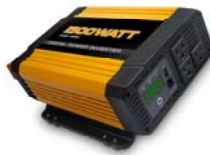
1500W (Model #: 10-00481)