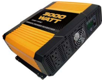
3000W (Model #: 10-00483)