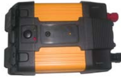
400W (Model #: 10-00477)