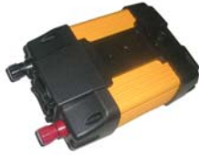
200W (Model #: 10-00476)