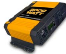
2000W (Model #: 10-00482)